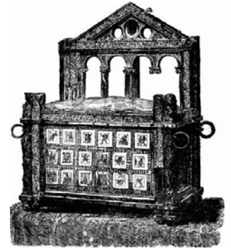
CHAIR OF ST. PETER, ROOME.

Today, the Feast of the Chair of St. Peter honors Saint Peter as the one Jesus chose to lead the community after he left the earth. Bishops taught the people as they sat in a special chair or throne called a cathedra (ka-THEE-dra), in their cathedral. The chair became the symbol of the Bishop's office, and Saint Peter was the leader of all the Church, just as our Pope is today.