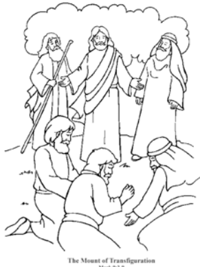
The Mount of Transfiguration Mark 9:2-9

Jesus took with him Peter and John and James, and went up on the mountain to pray. And while he was praying, the appearance of his face changed, and his clothes became dazzling white. Suddenly they saw two men, Moses and Elijah, talking to him. They appeared in glory and were speaking of his departure, which he was about to accomplish at Jerusalem. Just as they were leaving him, Peter said to Jesus, "Master, it is good for us to be here; let us make three dwellings, one for you, one for Moses, and one for Elijah" - not knowing what he said. While he was saying this, a cloud came and overshadowed them; and they were terrified as they entered the cloud. Then from the cloud came a voice that said, "This is my Son, my Chosen; listen to him!" When the voice had spoken, Jesus was found alone. And they kept silent and in those days told no one any of the things they had seen.